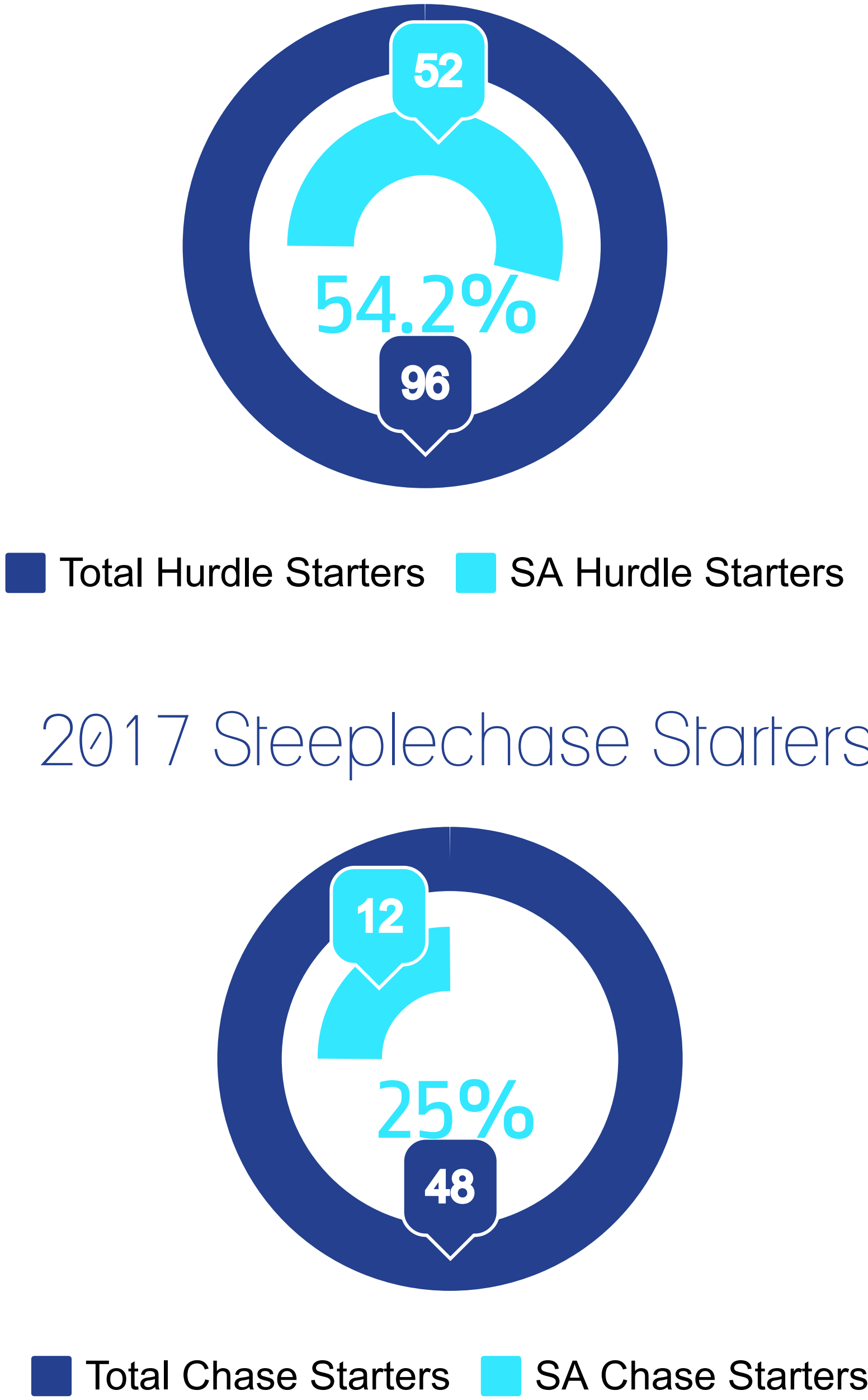
2017 Steeplechase Starters